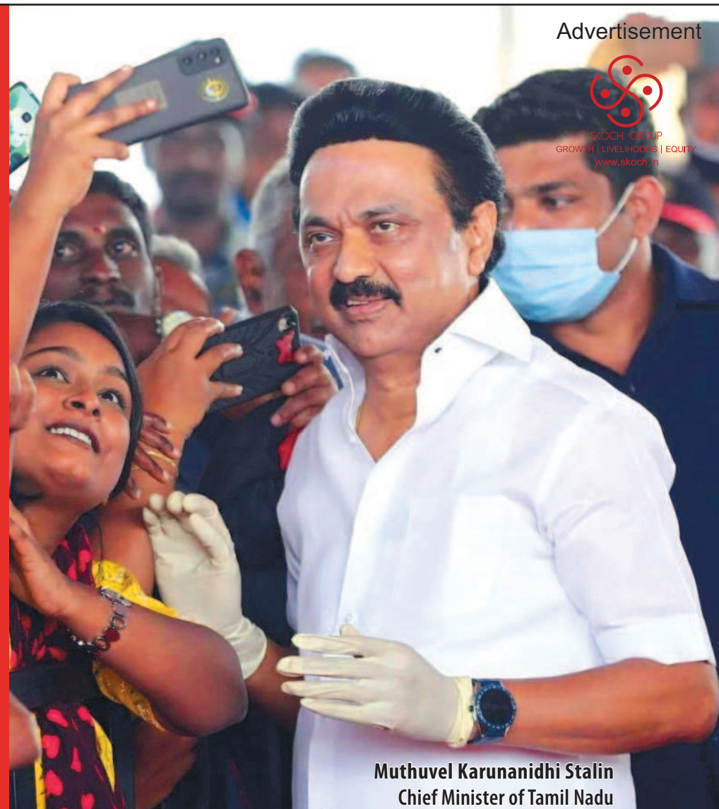
Muthuvel Karunanidhi Stalin Chief Minister of Tamil Nadu

• Tamil Nadu has already scored its 5-year cumulative score, from year 2014-2019, in just 2 years i.e., from 2020-2021